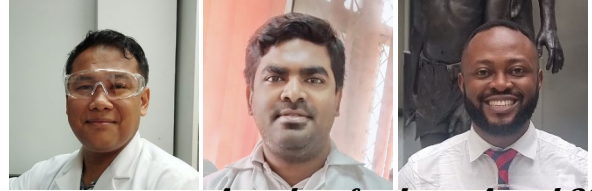
Awardees for Japan Award 2023