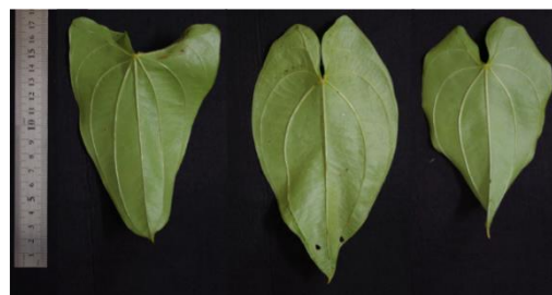
Fig. 2. As the leaf gets roundish the number of aerial tuber and ploidy level increases.